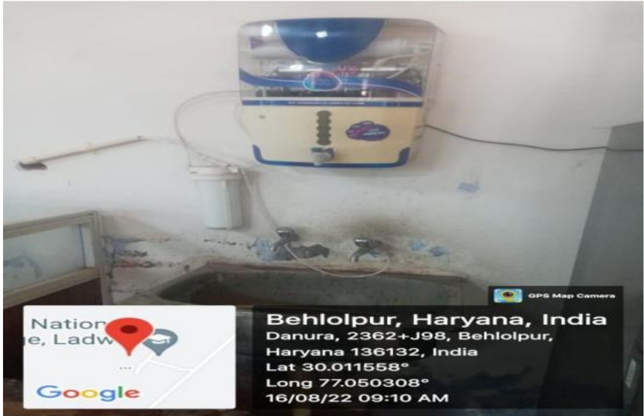
Figure 11: Water Purifier in College Office