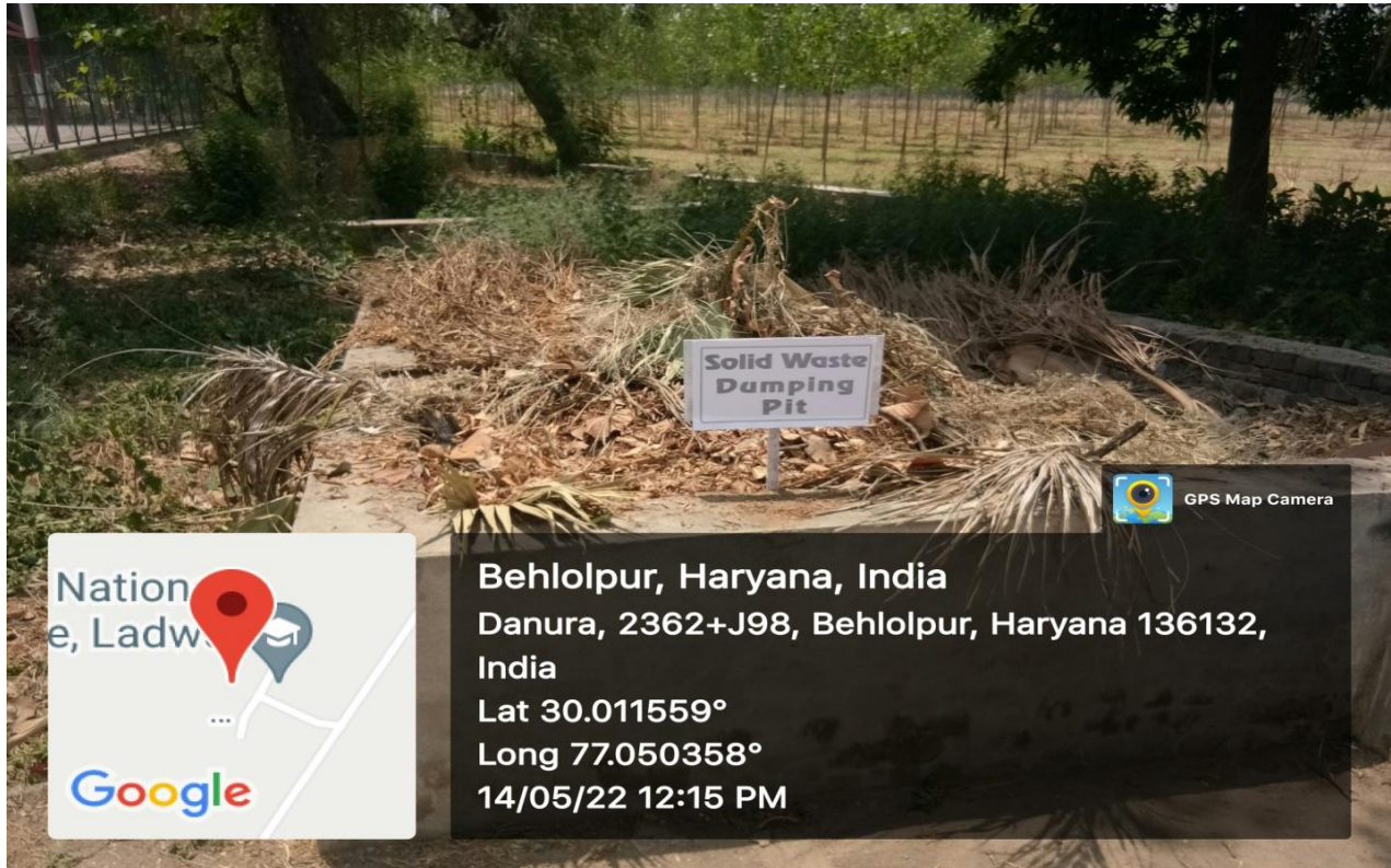
Figure 1: Solid Waste Dumping Pit, Behind College Office