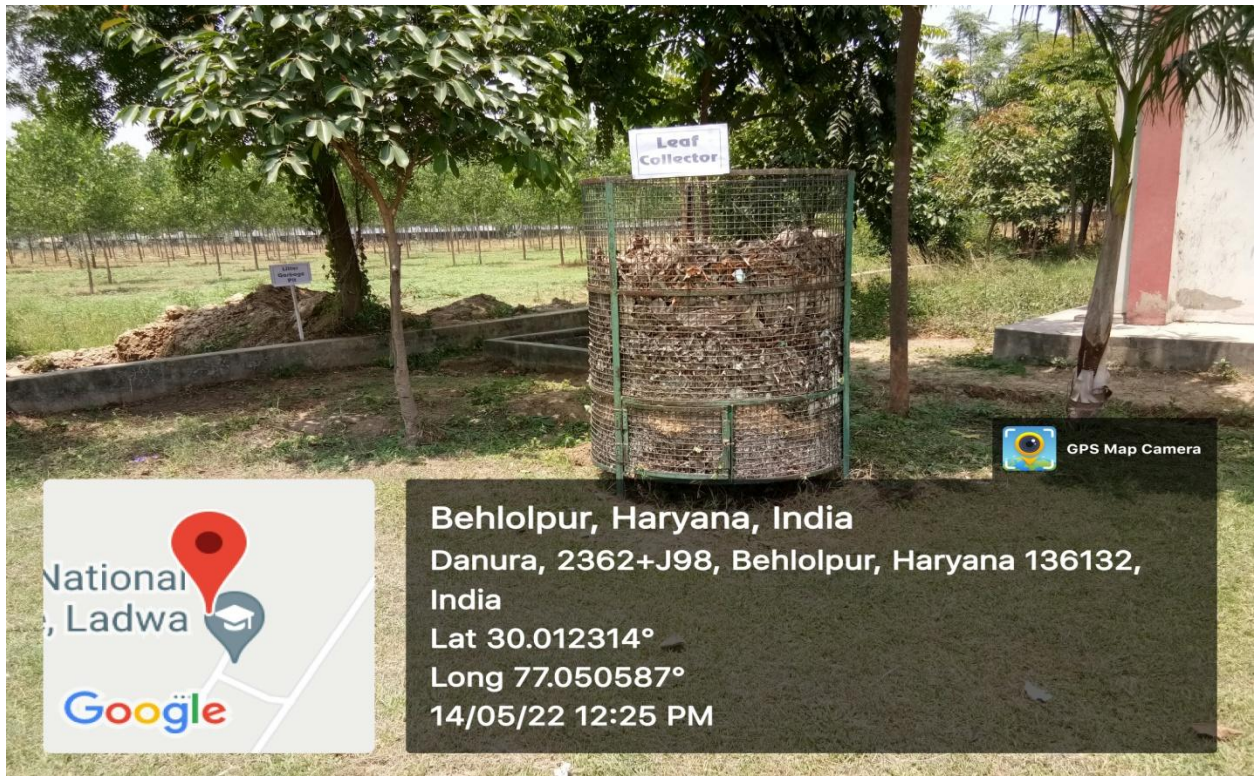
Figure 5: Leaf Collector, College inside Lawn