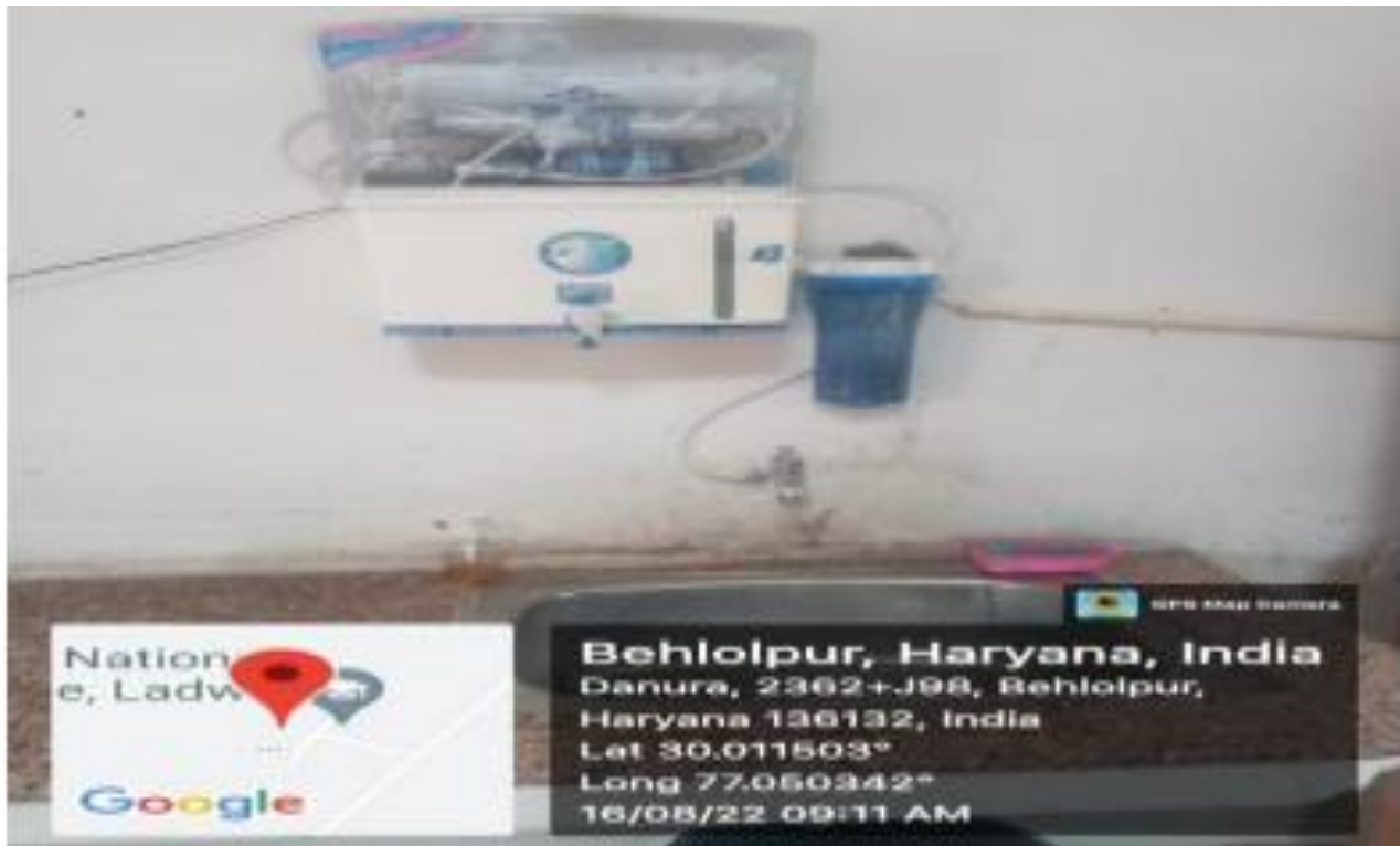
Figure 9: Water Purifier in College Staff Room