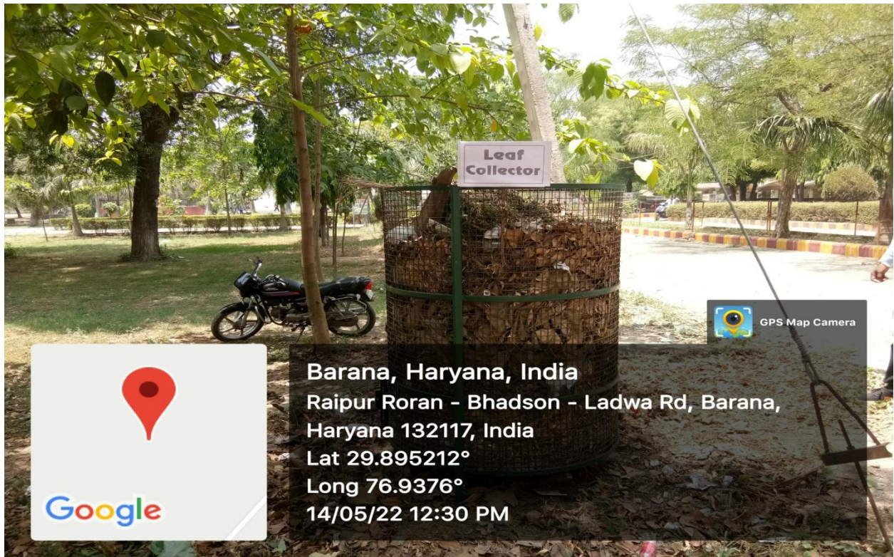
Figure 7: Leaf Collector, College Front-side Left Lawn