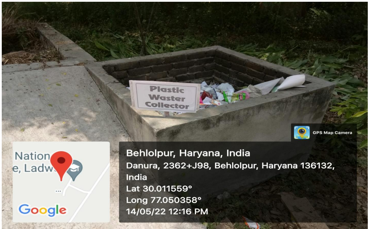
Figure 4: Plastic Waste Collector, behind College Office