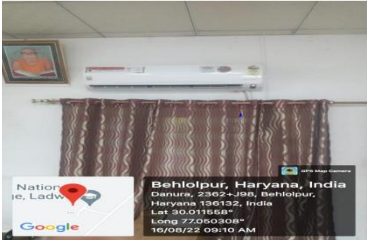
Figure 13: A.C. installed in the office of Principal