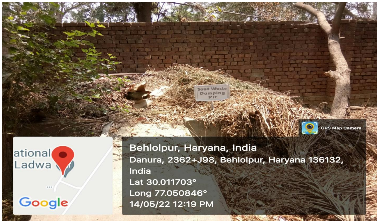
Figure 2: Solid Waste Dumping Pit, College Front Lawn