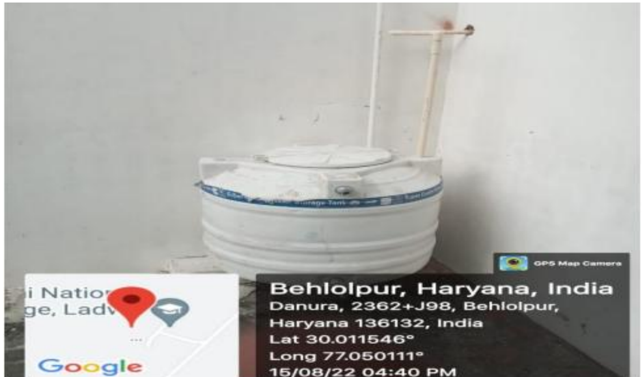
Figure 12: Container for the waste water of Water Purifier