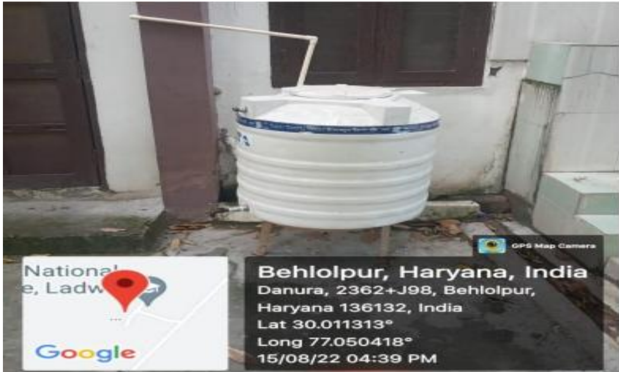
Figure 10: Container for the waste water of Water Purifier