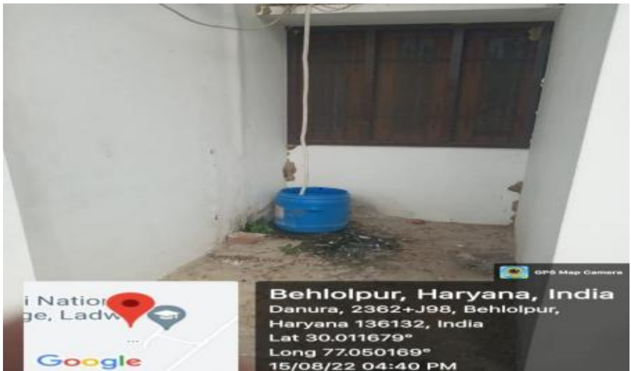
Figure 14: Container for the waste water of A.C.