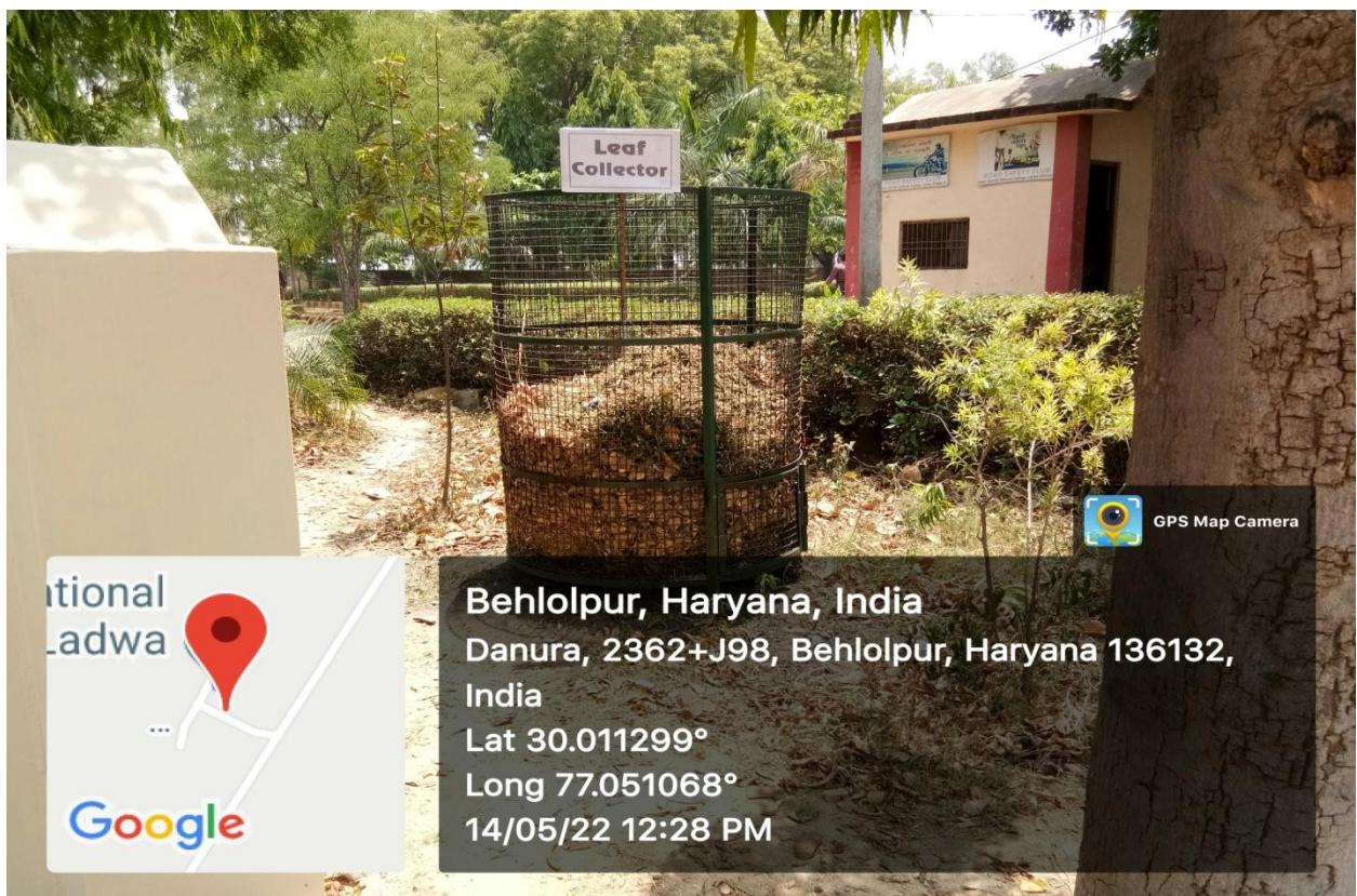
Figure 6: Leaf Collector, College Front-Side Right Lawn