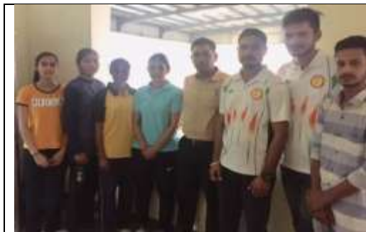
College Men & Women Rifle Shooting teams.