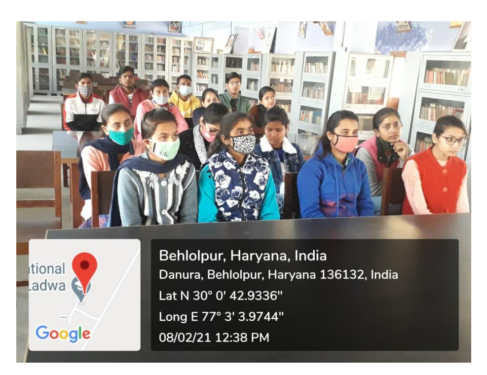
STUDENTS DURING INTERACTION WITH TEACHERS